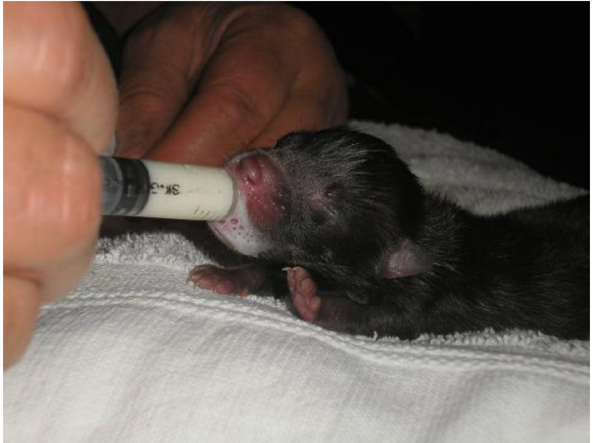
Fox Cub, Samantha

Three, 2 or 3 day-old fox cubs were found huddled together at the bottom of a garden in Devizes. They were found by Sky, a Collie dog. Although every chance was given for the vixen to collect them she did not return and we were left with no choice but to bring them into the hospital to hand rear.