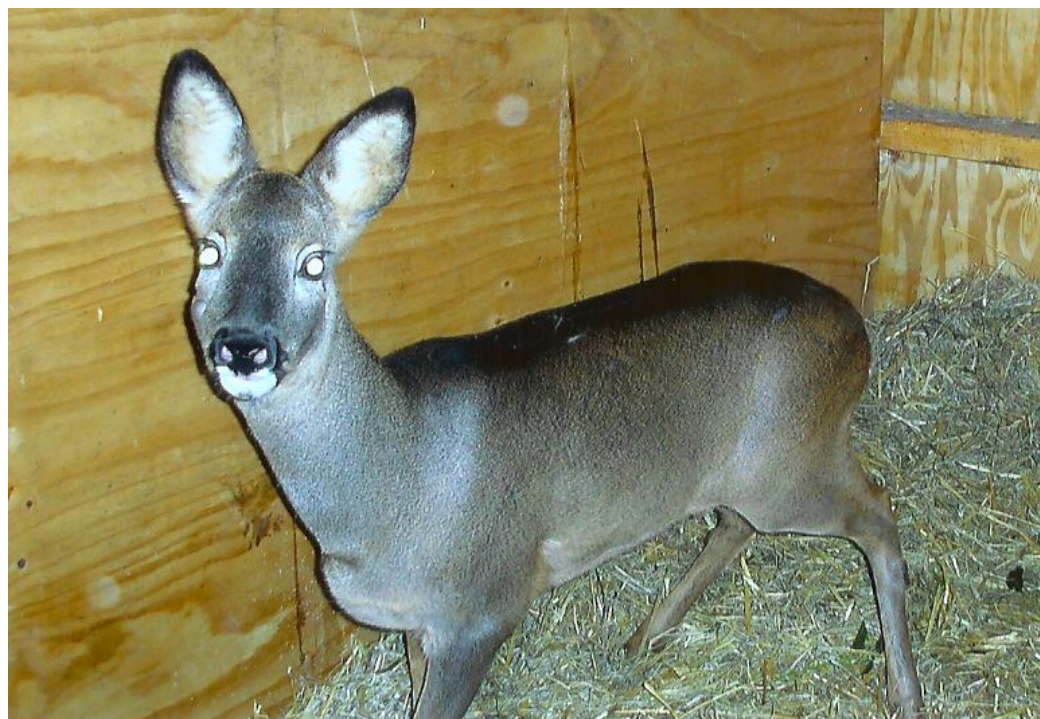
Apple – see 'Successful deer releases on page 5

WORKING WEEKENDS ARE HELD ON THE FIRST WEEKEND OF EVERY MONTH