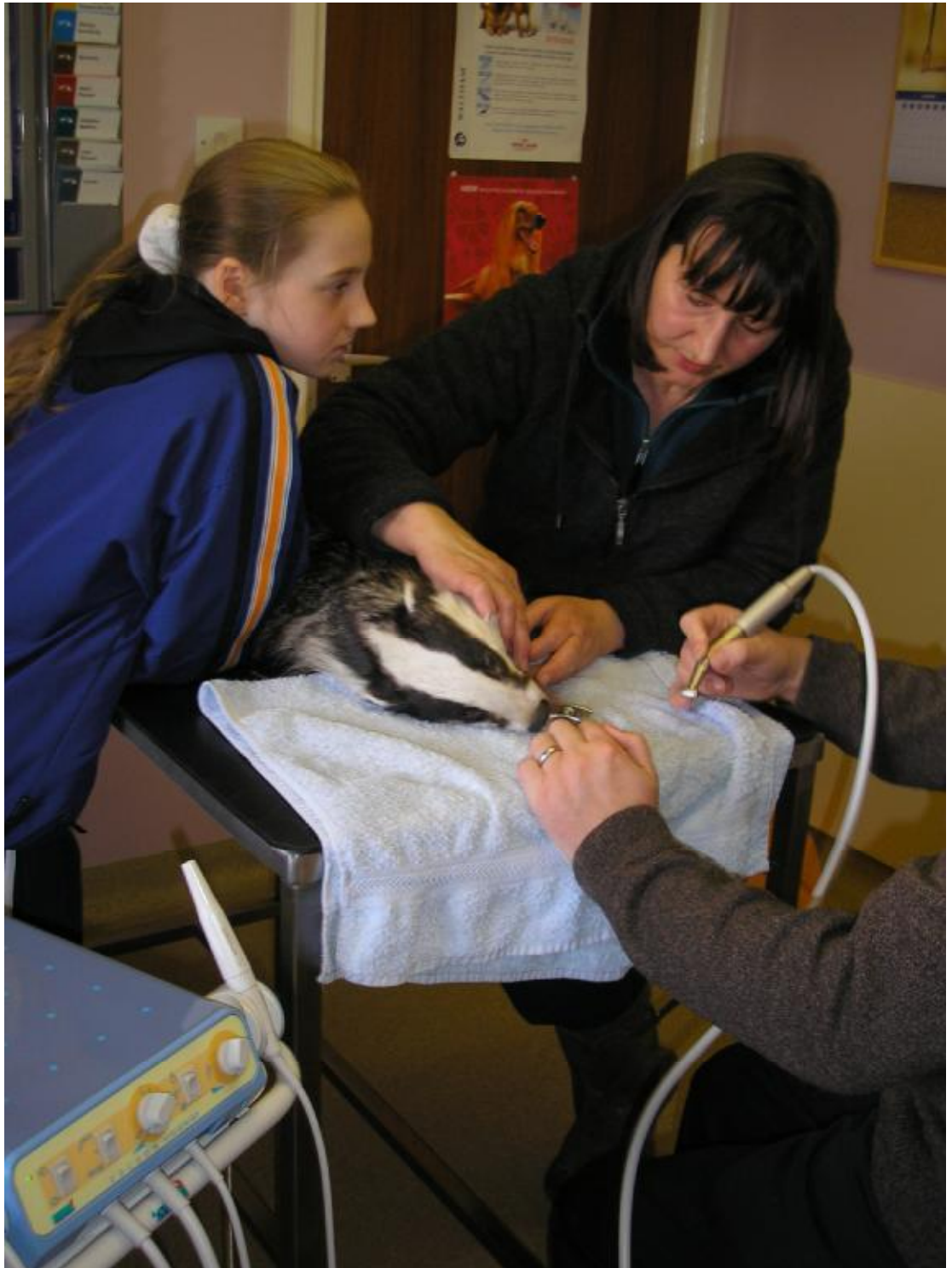
'Mrs Honey Badger' getting life-saving dental treatment – see page 5